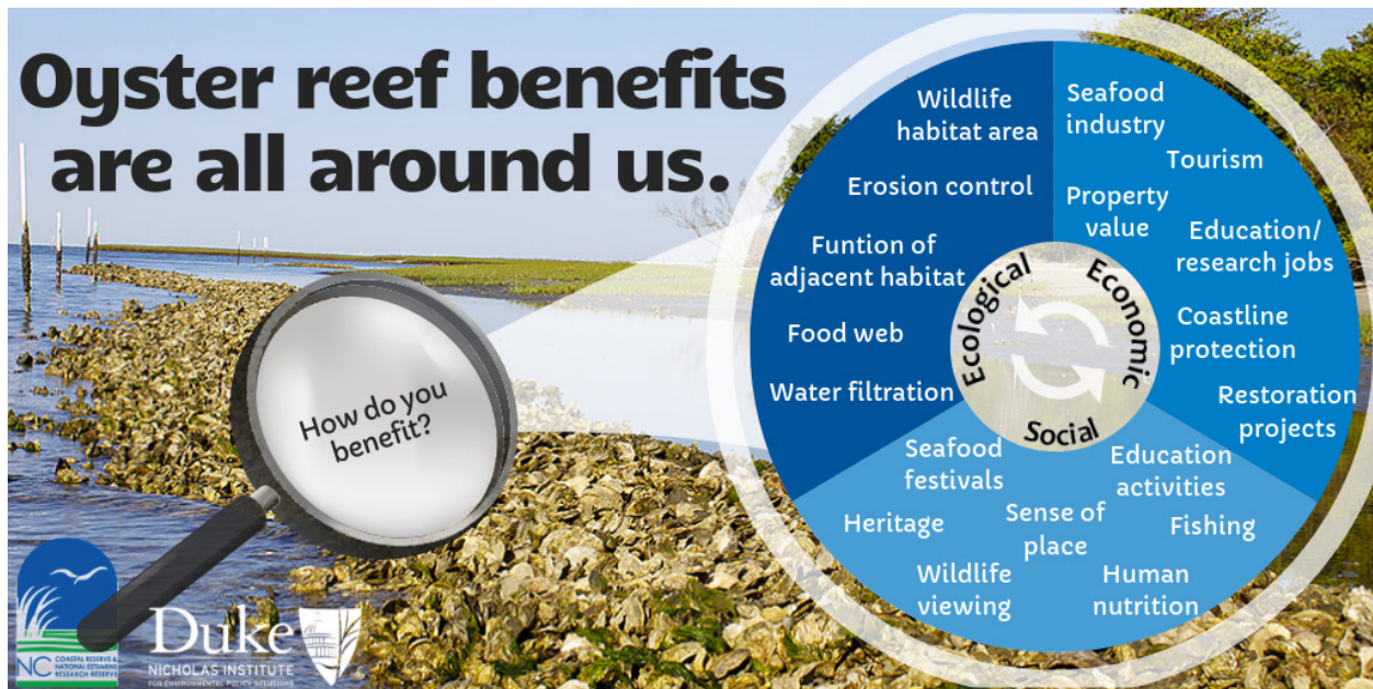
Figure 6. Example of an Infographic Created to Describe the Ecosystem Services of Oysters in North Carolina.