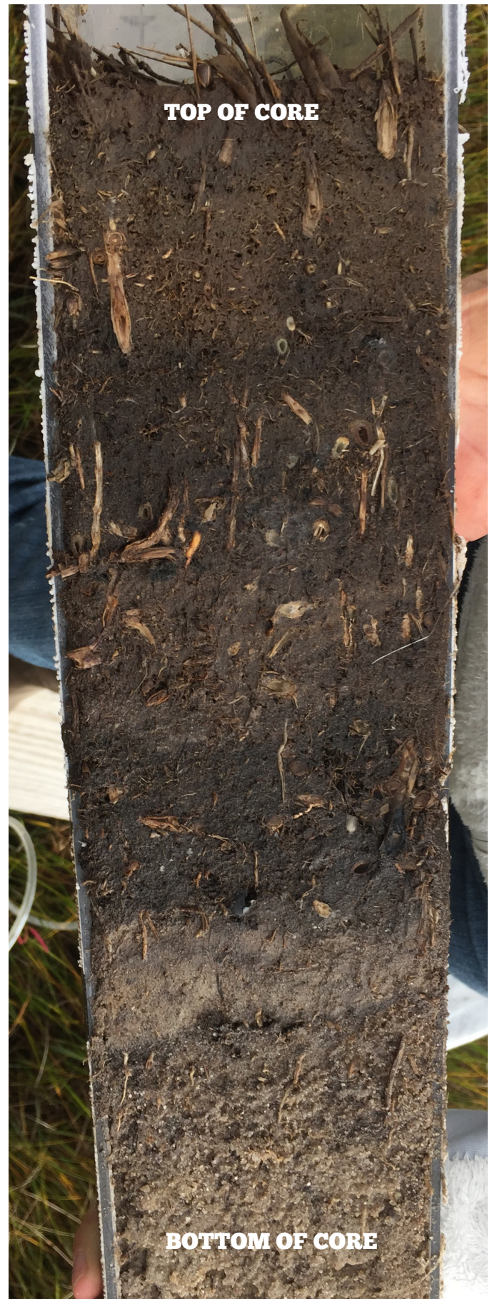
Photo of salt marsh core from Dr. Gonneea’s study site.