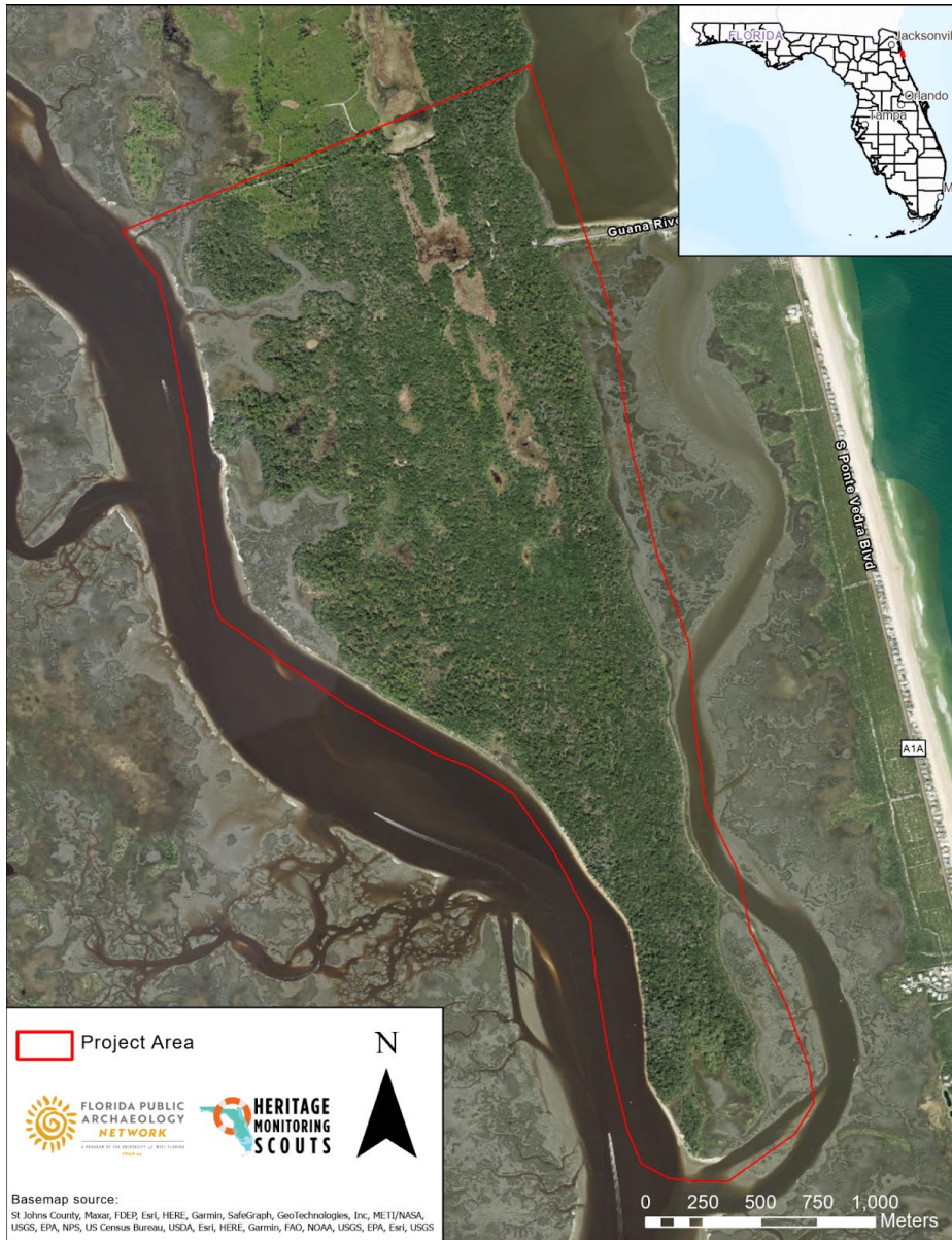
Figure 2. Monitoring activities were limited to the Guana Peninsula within the GTM NERR